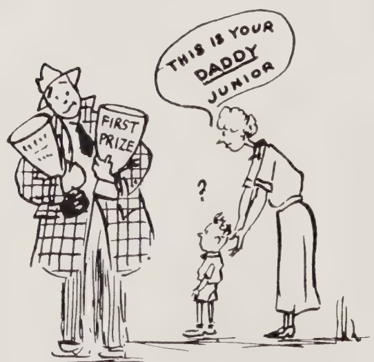
AT THE END OF THE SEASON